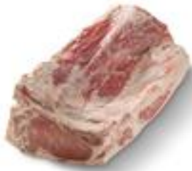
Image of product is not meant to represent the actual product trim specification

The Short Loin is the anterior portion of the loin, separated from the sirloin. The flank portion is removed. A cut is made approximately 1" from the extreme outer edge of the eye muscle at the rib end, and approximately 0" from the extreme outer muscle of the butt end. The flank is removed. The exterior fat of the short loin is trimmed to approximately 1/4" (plus/minus 1/4"). Fat in the saddle area is bridged from lean to lean. The end of the 13th rib and the knob on the end of the vertebra is sawed. Remaining pin bone is removed. The fat covering the tenderloin is trimmed to the blue tissue with flake fat allowed. Seam fat lying between the tender and the bone on the sirloin end will not be removed.