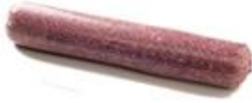
Image of product is not meant to represent the actual product trim specification

National Beef's 90/10 GROUND BEEF, uses commodity 90/10 trim combos from the upgrade table and 93/07 trim combos that are too fat. The raw material is ground and blended to the appropriate fat content then run through a finished grinder with a metal detection step.