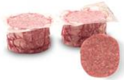
Image of product is not meant to represent the actual product trim specification

National Beef's FINE GROUND CHUCK PATTY uses trimmings that are from the Chuck, including Chuck Cap, Clods, Pectoral, Chuck Trim, and Chuck Roll. Shank will be added. The raw material is ground and blended to the appropriate fat content, then run through a finished grinder with a metal detection step.