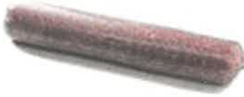
Image of product is not meant to represent the actual product trim specification

National Beef's 81/19 GROUND BEEF, uses trimmings that are from commodity trim, including Shank, 75/25 Deluxe Trimmings, 65/35 Deluxe Trimmings, Finger Trim. The raw material is ground and blended to the appropriate fat content then run through a finished grinder with a metal detection step.