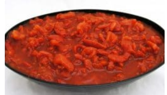
#10 Random Cut Pear Tomatoes in Puree