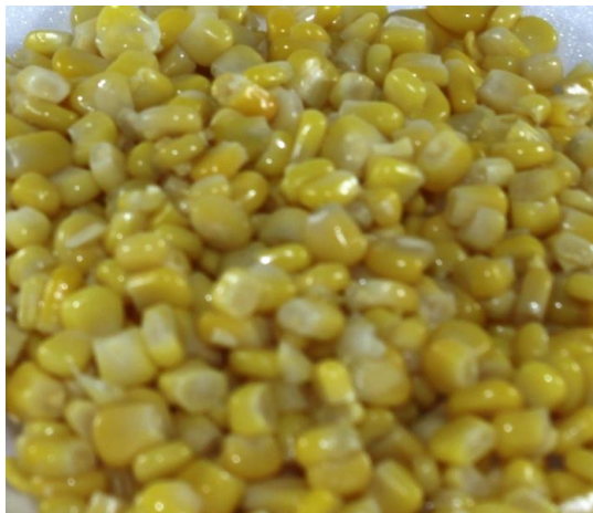
Product Picture 1: