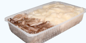
Rings & Tentacles

Item number: 227205A9 GTIN: 00815450020238