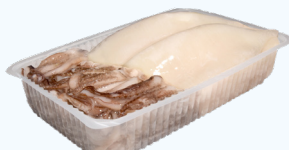
Tubes & Tentacles

Item number: 227205A8 GTIN: 00815450020269