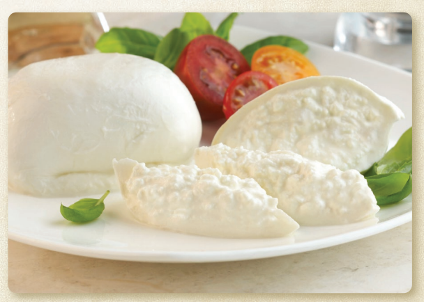
Serve Burrata as an antipasto with fresh tomatoes and basil