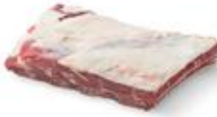
Image of product is not meant to represent the actual product trim specification

The B.I. Chuck Short Ribs are ribs 2 through 5 and the natural fat seam of the arm portion of the arm chuck. Fat on the seam side is removed to the blue tissue with only flake fat remaining Heavy cartilage is trimmed off.